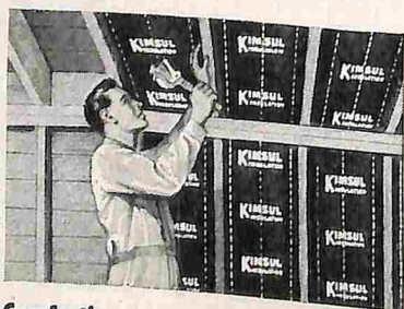
Comfortize your new home permanently with clean, light KIMSUL