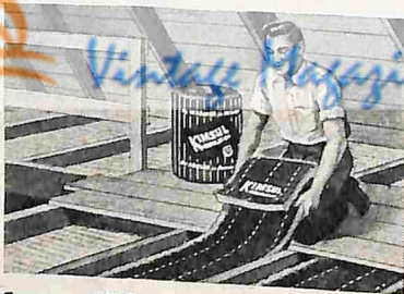
Easy as ABC to install KIMSUL in the sloping roof or attic floor of an existing home

Order KIMSUL from your lumber or building supply dealer, hardware or department store. Specify KIMSUL in your new home plans.