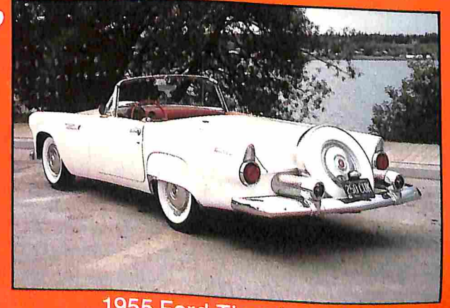
1955 Ford Thunderbird