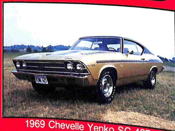
1969 Chevelle Yenko SC 427