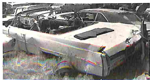
Sullivan's in Nebraska ... 36