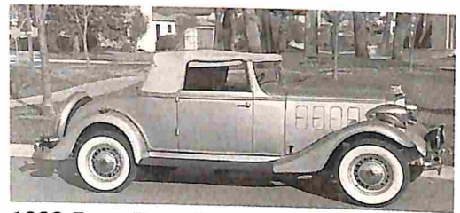
1933 Essex-Terraplane conv. ... 28