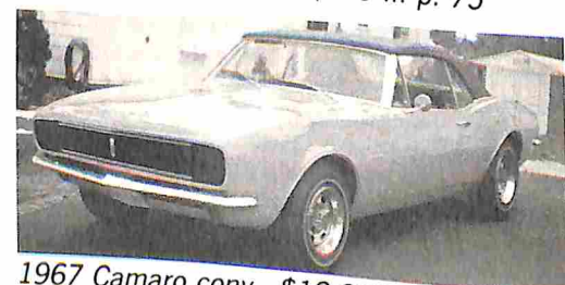
1967 Camaro conv., $12,000 ... p. 92