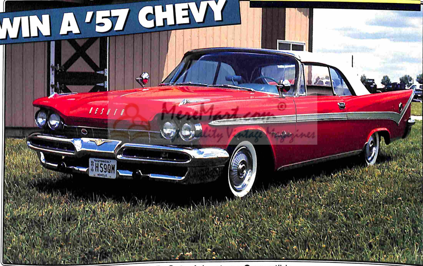
1959 DeSoto Adventurer Convertible