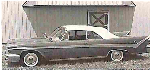
1959 DeSoto Adventurer conv. ... 14

P.O. Box 482 • Phone 513-498-0803 • Sidney, OH 45365