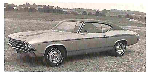
1969 Chevelle Yenko SC 427 ... 52