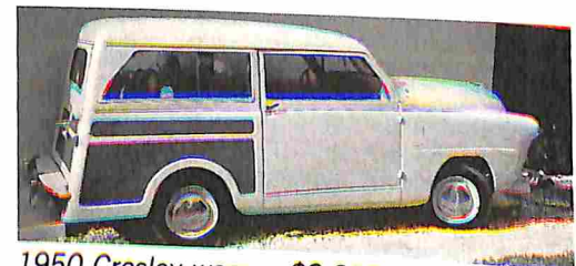
1950 Crosley wagon, $3,850 ... p. 75