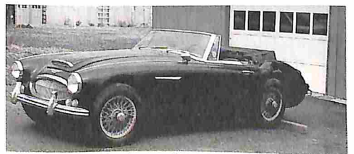
1967 Austin Healey ... $5,750, p. 144