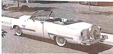
1953 DeSoto convertible ... p. 20