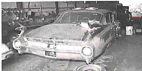
Salvage yard expands ... p. 58