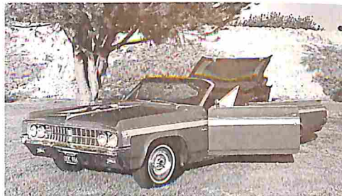
1963 Olds Starfire conv. ... p. 48