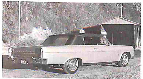
1954 Rambler convertible ... p. 56