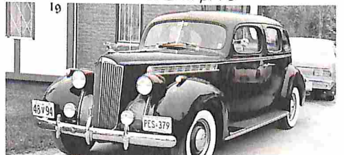
1940 Packard sedan ... $10,500, p. 139