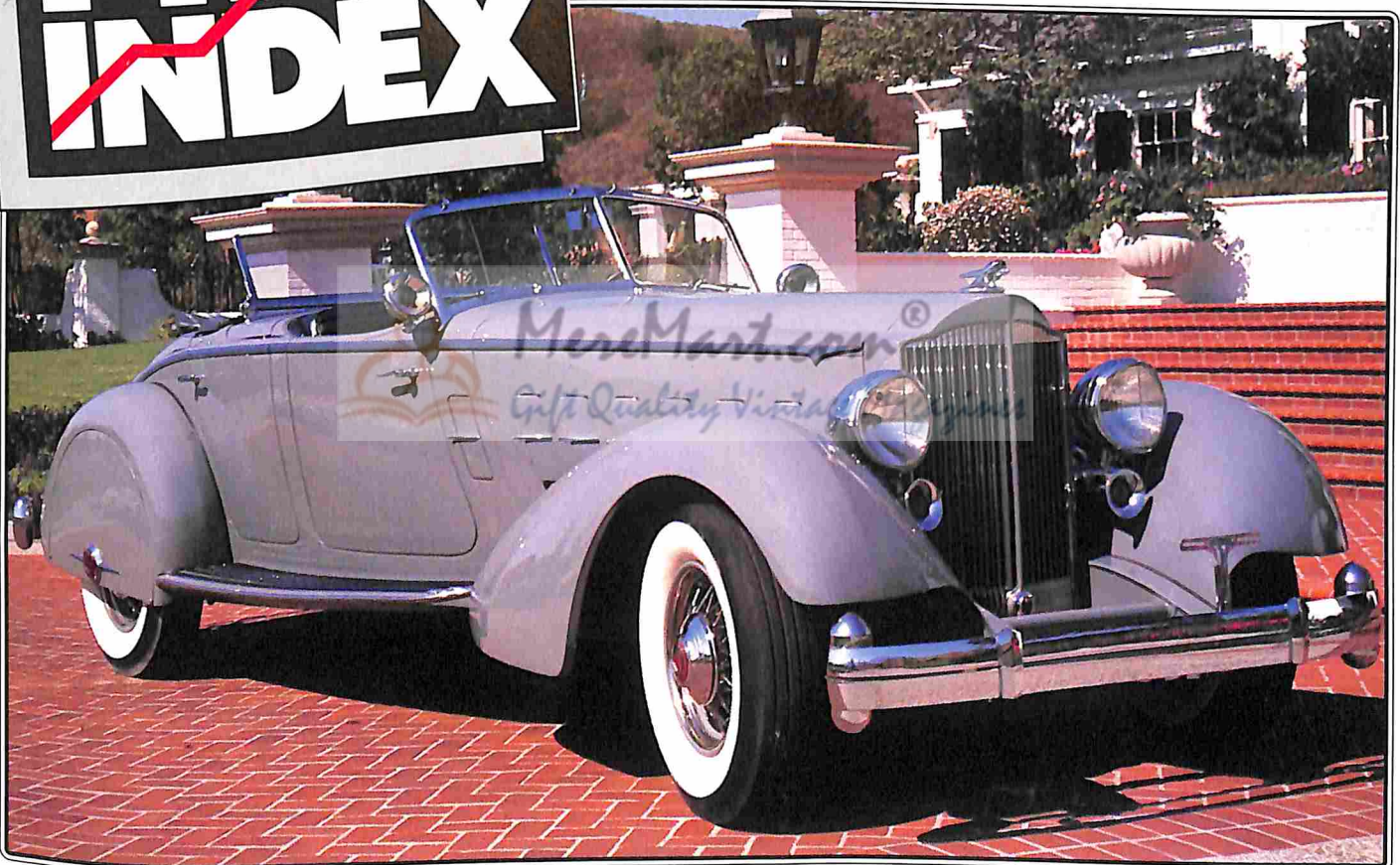
1934 Packard V-12 Sport Phaeton