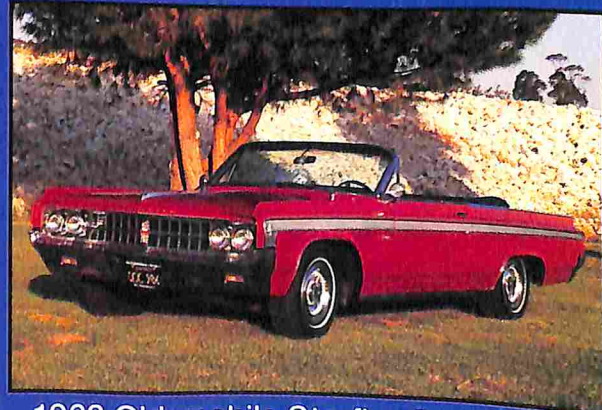
1963 Oldsmobile Starfire Convertible