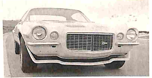
1970 Hurst Camaro ... 20