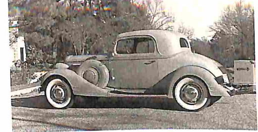
1934 Pontiac coupe ... 56