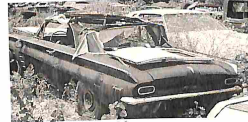
Rony's salvage... 36