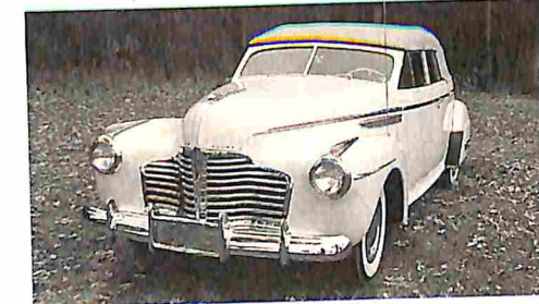
1941 Buick phaeton ... 48