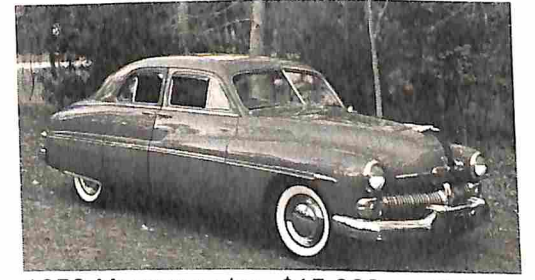
1950 Mercury sedan, $15,900 ... 113