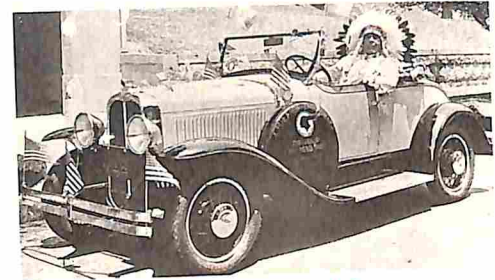
Pontiac-Oakland history ... 14

P.O. Box 482 • Phone 513-498-0803 • Sidney, OH 45365