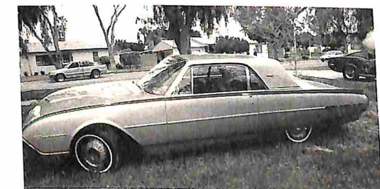
1962 Thunderbird hardtop, $6,000 ... 135