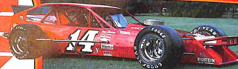
TONY SISCONI'S NASCAR MODIFIED