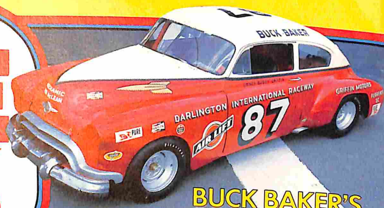
BUCK BAKER'S '50 OLDS STOCKER