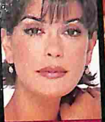
LOIS & CLARK