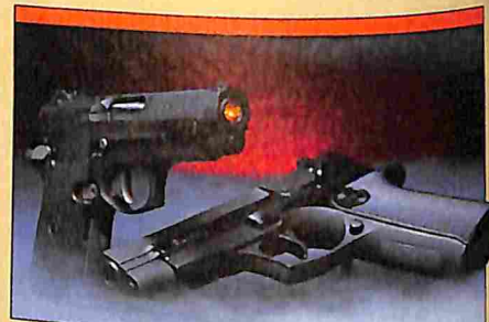
ULTRA-COMPACT '40' PAGE 32

GUNS & AMMO MAGAZINE, Copyright 1991 by Petersen Publishing Co. All rights reserved. CAUTION: Some advertisements may concern products that are not legally for sale to California residents or residents in other jurisdictions.