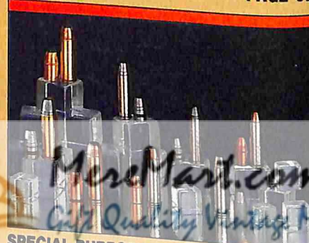
SPECIAL-PURPOSE LOADS PAGE 42