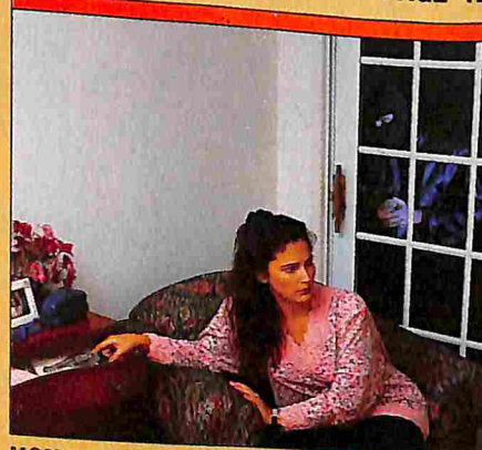
HOME-DEFENSE HANDGUN PAGE 46