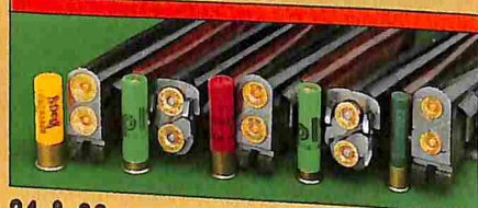
24 & 32 PAGE 50