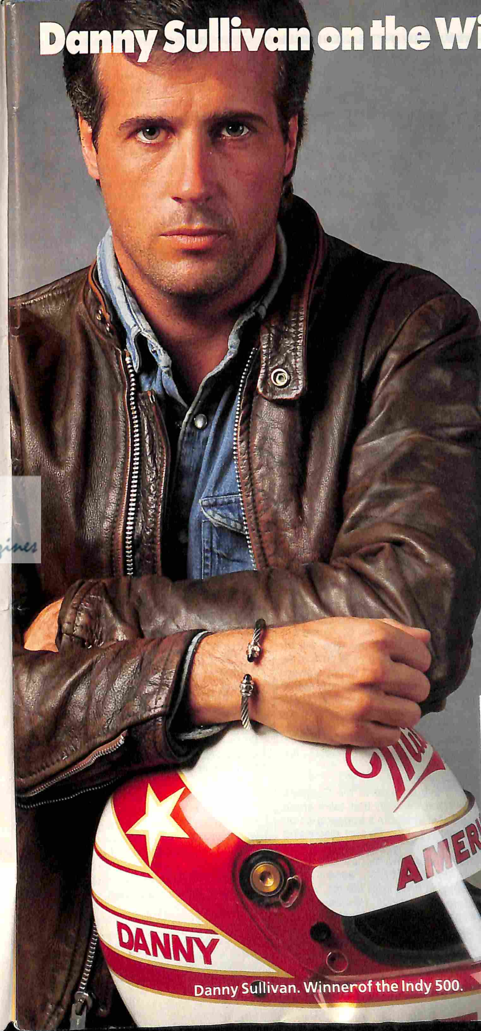
Danny Sullivan. Winner of the Indy 500.