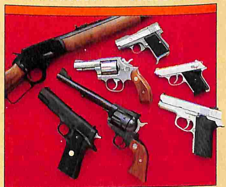
DEFENSE GUN PAGE 62