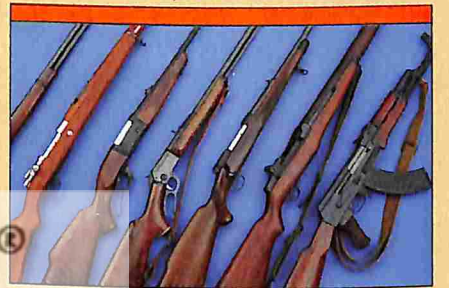
TOP 10 RIFLES PAGE 44