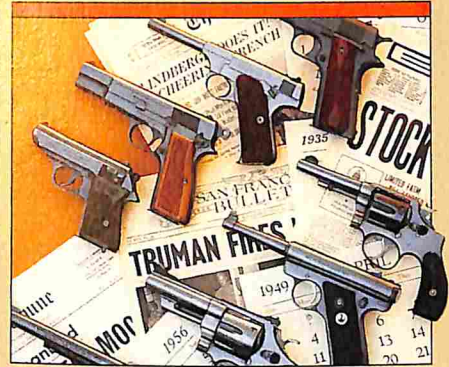
TOP 10 HANDGUNS PAGE 34

GUNS & AMMO MAGAZINE, Copyright 1991 by Petersen Publishing Co. All rights reserved. CAUTION: Some advertisements may concern products that are not legally for sale to California residents or residents in other jurisdictions.