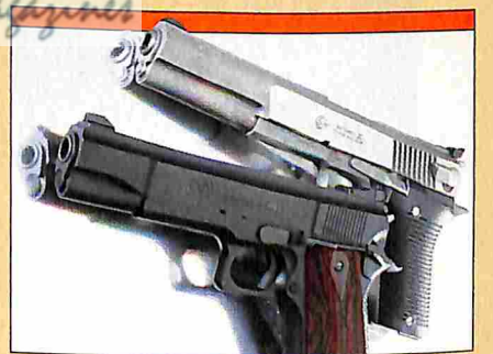
POWERHOUSES! PAGES 56 & 57