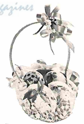
Lacy basket holds eggs

paper, lightweight cardboard, soufflé cups, duck cutouts and ribbon are the only materials needed. At the right is a sugar 'n spice ribbon and lace basket to fill with jelly beans or colored eggs. It's made of crepe paper, a round paper container, 10" lace paper doily, and ribbon bows and flowers to trim. Of course you'll need place cards, too. The one below has a little bunny (sitting on a lace paper doily), who peeps around the card that tells someone where to sit. In addition to the doily,