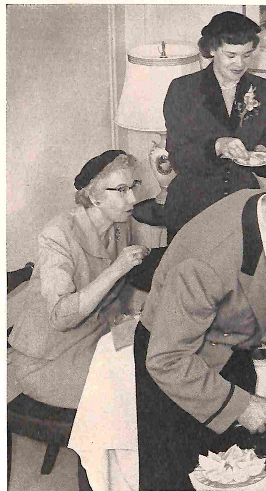
LEADING HOME ECONOMISTS sit at table of Sunkist Consumer Service Director. After tasting 23 unsalted foods with an eye for salt, one of lemon works wonders for otherwi

The following list, page by page, shows the source in this issue was gathered. Where