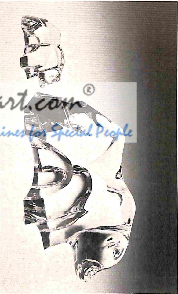
Bear Cub, 4 1/2" length, 135.00.