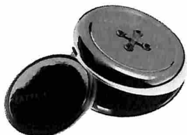
[ESTÉE LAUDER EXCLUSIVE COMPACT]

"Cute as a button," he thought, "that's what she is." Then he spied the evening bag: