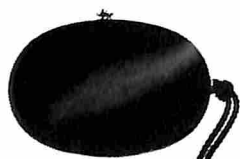
[OUR OWN EXCLUSIVE

"Cute as a button," he thought, "that's what she is." Then he spied the evening bag: