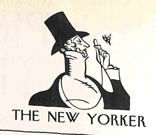
TABLE OF CONTENTS DECEMBER 5, 1988

Easy to make; simply place onehalf oz. of each in a snifter glass and heat in a microwave for 25 seconds. (Or 2 minutes in a saucepan on high.) The steamy blend is extraordinary, Chambord &