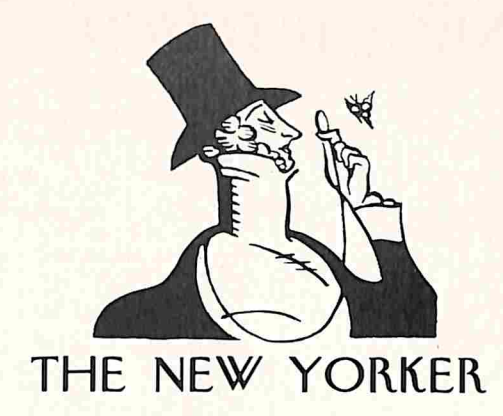
TABLE OF CONTENTS OCTOBER 17, 1988