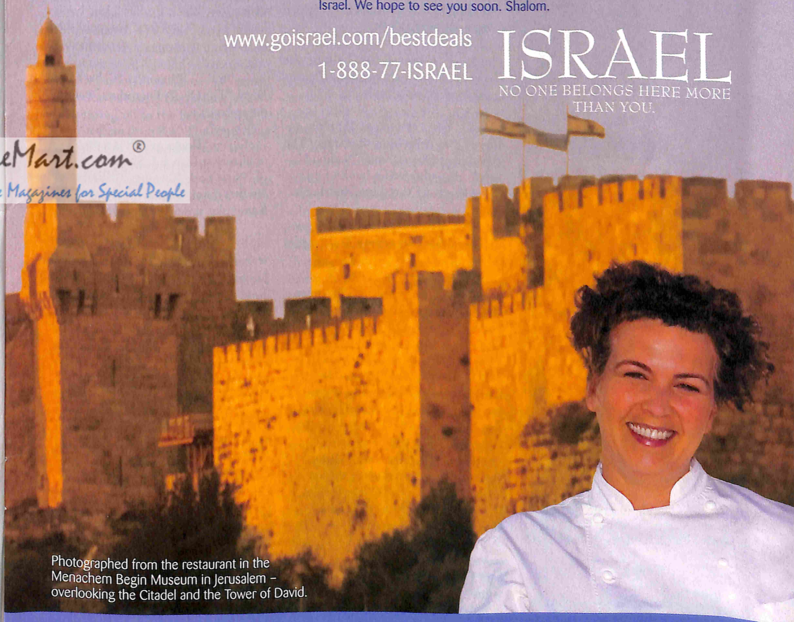
Photographed from the restaurant in the Menachem Begin Museum in Jerusalem - overlooking the Citadel and the Tower of David.

MereMart.com® Vintage Magazines for Special People