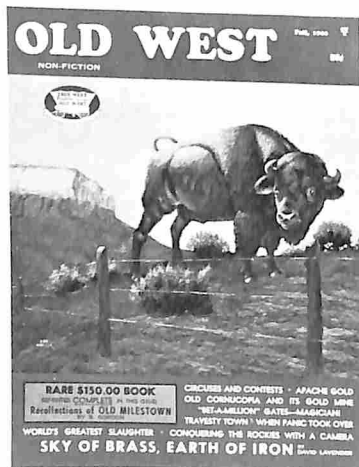
Cover Painting by DAN MULLER