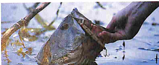
Add a new twitch to your summer bassing technique. (page 56)

Hand-held Loran-C and GPS units can keep you from ever getting lost in the woods again. (page 52)