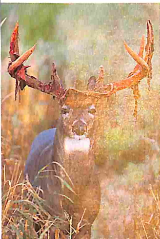
Velvet peeling is a sure sign of fall hunts soon to come. (page 48)