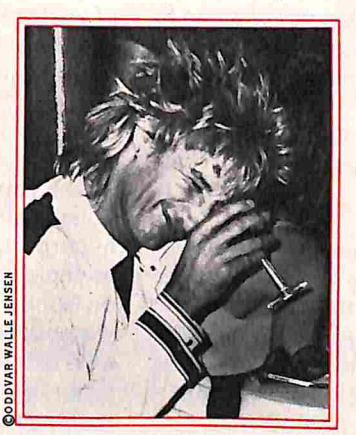
Rod Stewart: acting goofy, 63