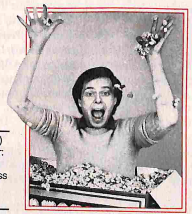
King of diamonds, 72

Cover photographs: (Beach Boys) ; Inset center (Dennis Wilson) ; Inset top: (Princess Caroline and Stefano Casiraghi)