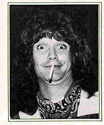
You wanna see US? 36