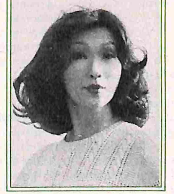
Tomorrow may be Today, 34