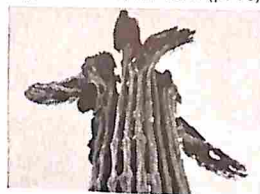
A lighter trunk, he said (p. 78)