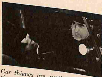
Car thieves are getting smarter all the time—but so are cops. Page 66.