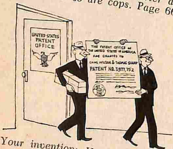
Your invention: How to protect it, patent it, cash in on it. Page 89.