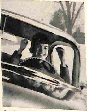
Look, no hands! Will the car in your future drive like this one, guided by radio? PS gives you a peek at tomorrow