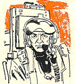
"Bow Legs Control... I'm at 13,500 and I'm going to 16,000 before I turn the power off..."