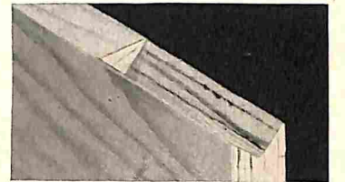
Say good-bye to those plywood layer-cake edges. PS shows you how the pros finish them off

EDITORIAL OFFICES: 353 Fourth Ave., New York 10, N.Y.