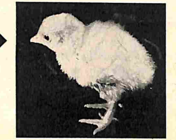
It can happen with turkeys (like little Olie above) but probably not with humans.