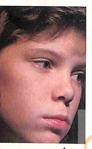
PAGE 38 Time Heals

EXECUTIVE AND EDITORIAL OFFICES: Psychology Today Magazine, (USPS/504-170), 1150 Seventeenth St., N.W., Suite 408, Washington, D.C. 20036. Editorial contributions must be accompanied by return postage and will be handled with monthly except February and August. Volume 22, Number 11. POSTMASTER: Send adverses changes to Psychology Today, P.O. Box 55046, Boulder, CO 80322-5046. Second-class postage paid at Washington, D.C. 20036 and at additional mailing offices. Canadian postage so Psychology Today, Manitoba. One-year subscription rate for U.S. and possessions, $15,99; Canada, $18.99. All other countries, one-year P.O. Box 55047, Boulder, CO 80322-5047. Subscription inquiries and address change's send to: PSYCHOLOGY TODAY, Customer Service, P.O. Box 55046, Boulder, CO 80322-5046.