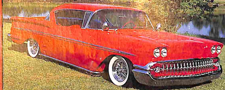
Award-Winning '58 Chevy Custom