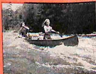
page 33: a fisherman's dream spot—rugged and remote