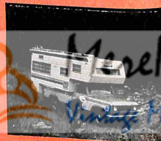
page 62: a report on which RV is right for you