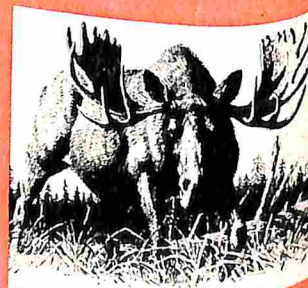
page 58: where to go for those heavy-racked bulls