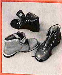
page 64: understanding which boot suits you best