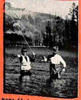
page 41: how to choose the park that suits your needs