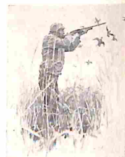
page 76: how much do you know about waterfowling