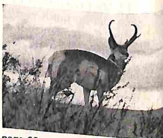
page 66: everything you need to know for a fall antelope hunt