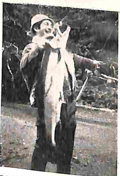
page 64: techniques for West Coast steelhead