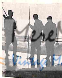
page 68: how to find and catch fish in the surf