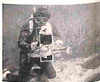
page 51: the most thorough study of the bass ever undertaken