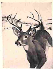
Cover by Bill Reusswig