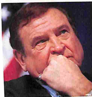
Congress: Rosty's demotion takes it down a peg

COVER: The Threat from North Korea ..... 24 After months of playing diplomatic chicken, the U.S. and the U.N. are preparing to clamp economic sanctions on Pyongyang. If Kim has the atom bomb, will he fight to keep it? Money Pipeline: Where Kim gets his hard currency The Political Interest: Sanctions have their uses War Games: Some say the North wins; the Pentagon says no way