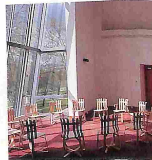
Design: Will there be money to fill these chairs?