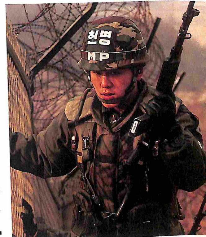
Cover: Ready for a showdown, if necessary, between the Koreans