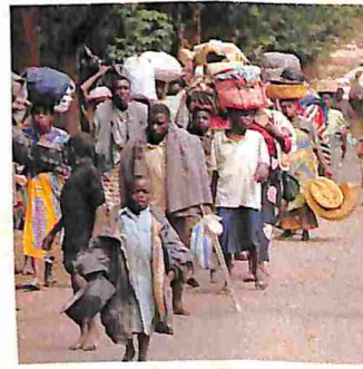
Central Africa: Refugees seeking safety in numbers