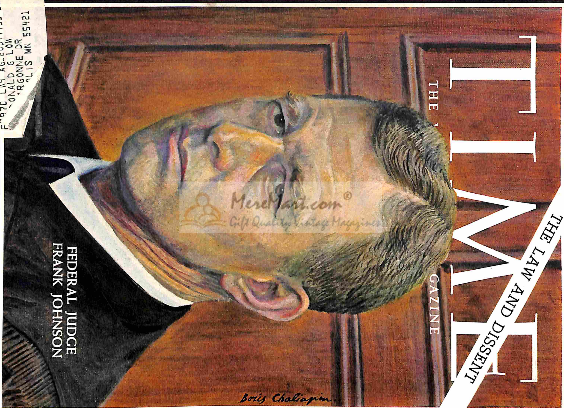
FEDERAL JUDGE FRANK JOHNSON