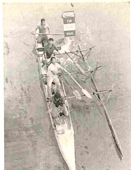
THE MAILMEN OF NIUAFO'OU

"Well, only nine out of 37 seen each copy that you've send recently. All the uneducated people keen to see such magazines pictures and cut them hanging and fixed to walls and roofings [rafters] of their Tongan houses. But they first keen to know and understand from any reader what's that picture for? Who are these men on the cover of every TIME? Good or Bad, Brave or wealthy, Communist or else?"