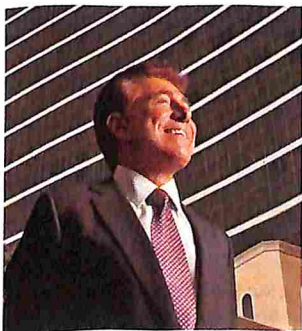
43 ▲ Magnate Steve Wynn outside his new, eponymous Vegas hotel (interior, right)