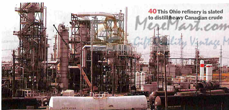
40 This Ohio refinery is slated to distill heavy Canadian crude