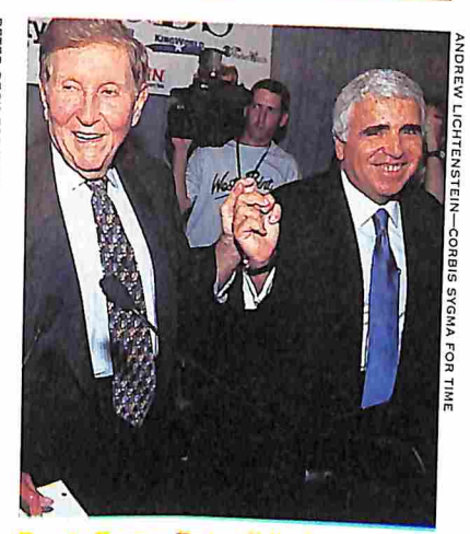
Two to Tango: But will Redstone or Karmazin lead? (see Business)