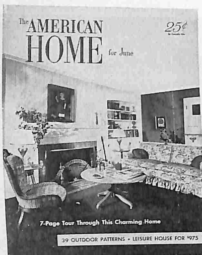
A living room so inviting, and so good in detail, that we're taking you into every room in the house. See page 31.