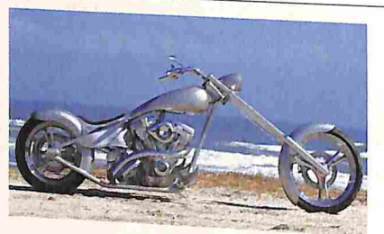
116 ECHELON ELITE RIGID CHOPPER Long, low, sleek, and powerful