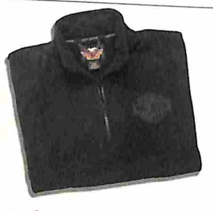
146 H-D'S PULLOVER FLEECE A good choice for cold weather riding