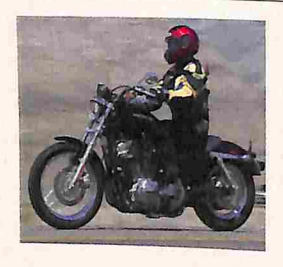
106 2005 XL SPORTSTER 883L A Sportster for rid-