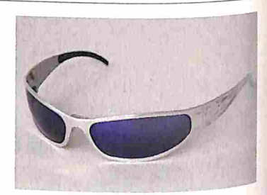
152 GATORZ Checking out the Radiator and Raptor