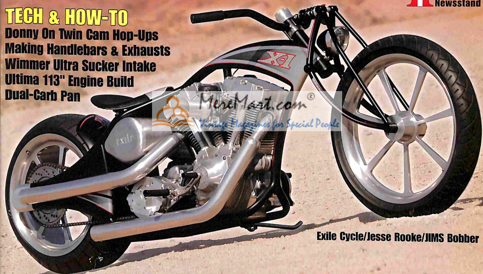
Exile Cycle/Jesse Rooke/JIMS Bobber