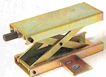
163 K&L CENTER JACK A must-have tool for the home or professional mechanic