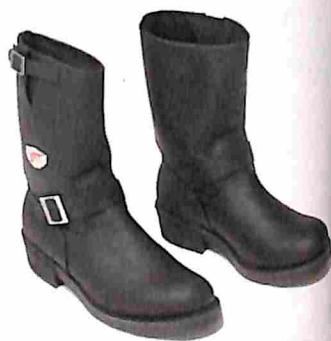
167 RED WING BOOTS Engineer boots with a bit more style