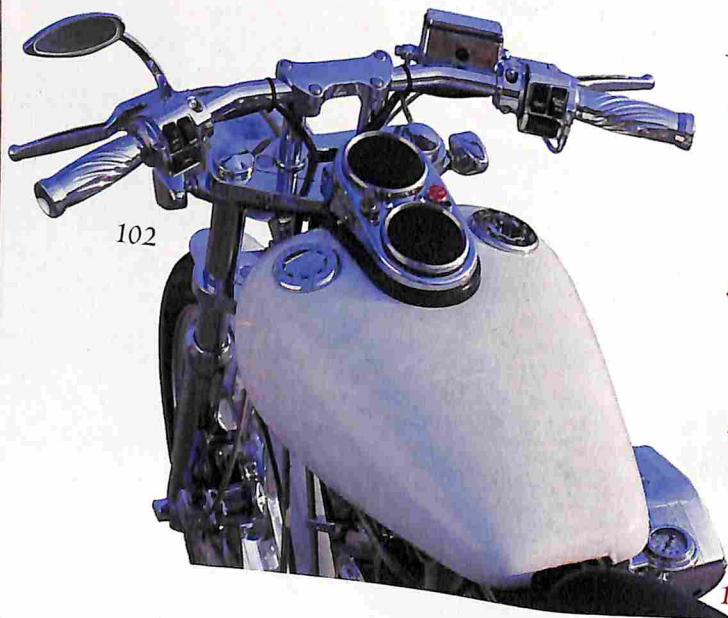
COVER: RIDE, TRAILER & RIDE Morri's 116" rider-friendly Pro-Street