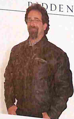
162 ULTRA CLASSIC LEATHER A great midweight jacket from The Motor Company