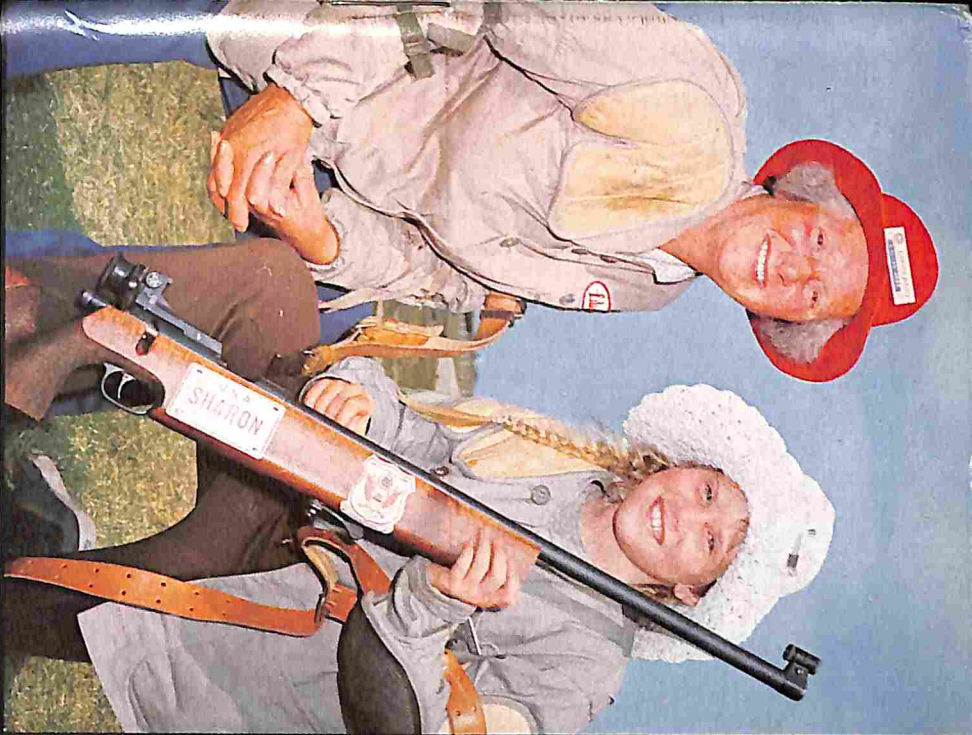
The Ladies at Camp Perry