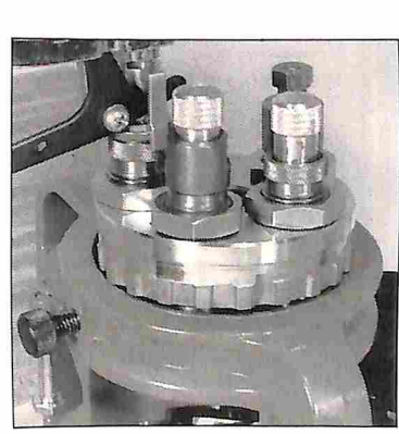
Precision 5-Hole Turret with 20 locking lugs takes just seconds to change.

Owners of 1992 Load-Masters who have experienced priming or indexing problems because the carrier has moved out of position should order #99000 Repair Kit. It is very easy to do and the kit is free