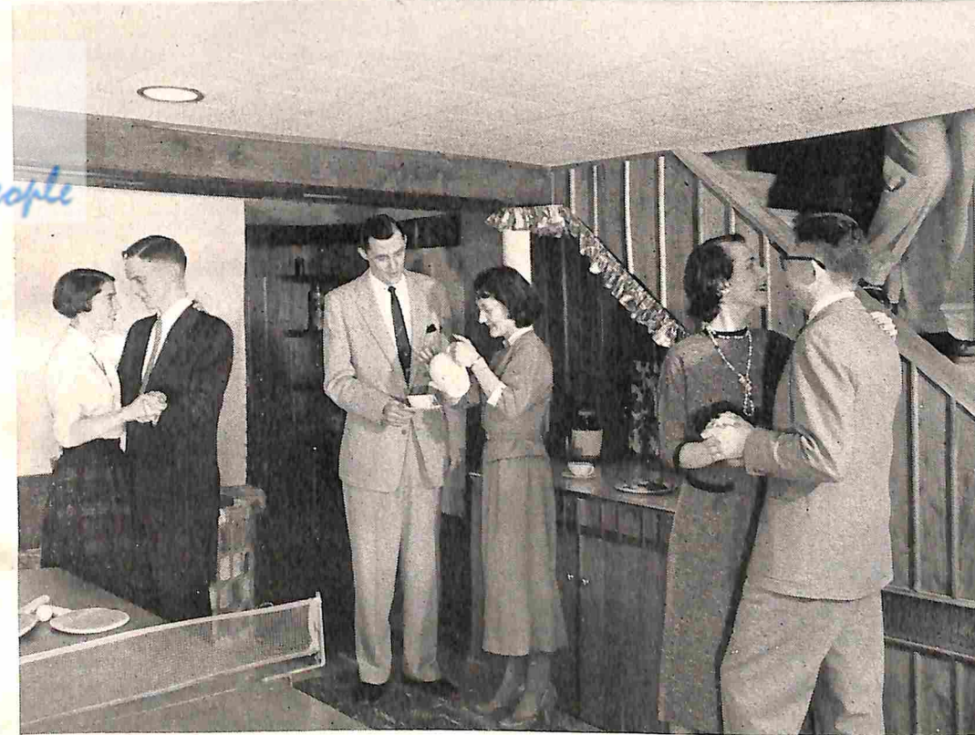
Parties are more fun under a Cushiontone ceiling. Sounds of voices, phonograph, dancing feet, games never get a chance to build up into nerve-jangling din. Guests will compliment you on the good looks of Cushiontone's Full Random styling, too. Cushiontone's washable finish is as easy to clean as painted plaster ceiling, and it can be repainted as often as you like without affecting its efficiency.

Smart-looking tile ceiling that quiets noise costs only a little more than ordinary ceiling materials . . . and you can install it yourself