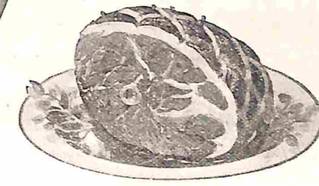
HAM BUTT BAKED WITH CLOVES—See page 7 of "60 Ways to Serve Ham."

*The number after each of the above suggestions is the number of the recipe in "60 Ways to Serve Ham."