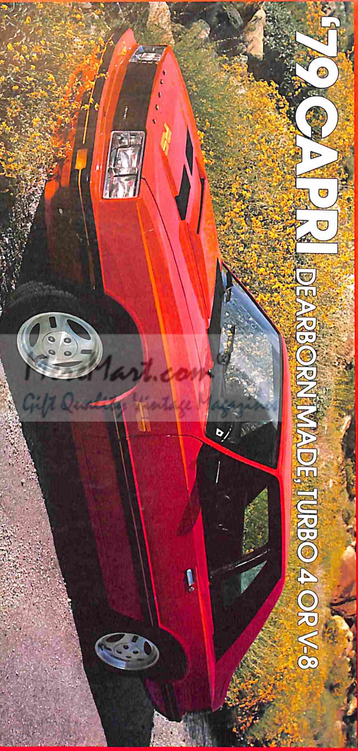
'79 CAPRI DEARBORN MADE, TURBO 4 OR V-8

HIGH-BUCK THRILLS: MERCEDES TURBO DIESEL, PORSCHE 928 AUTOMATIC AUGUST 1978 • ONE DOLLAR