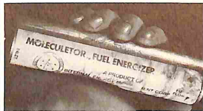
The untold story. Page 64