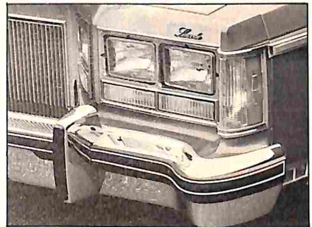
Challenging the Seville.