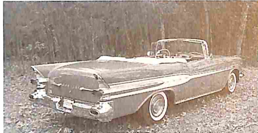
1957 Pontiac Star Chief conv. ... p. 20