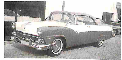
1955 Ford hdtp ... $10,995, p. 116