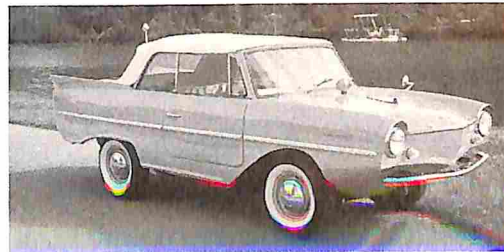
1967 Amphicar conv. ... p. 48