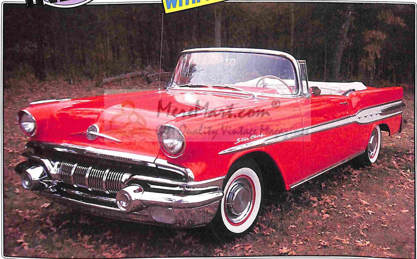
1957 Pontiac Star Chief Convertible