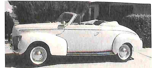
1940 Mercury conv. ... $26,000, p. 117