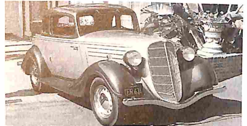
1935 Terraplane coupe ... p. 36