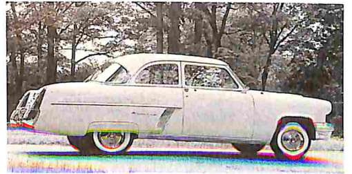
1952 Mercury Custom sedan ... p. 64