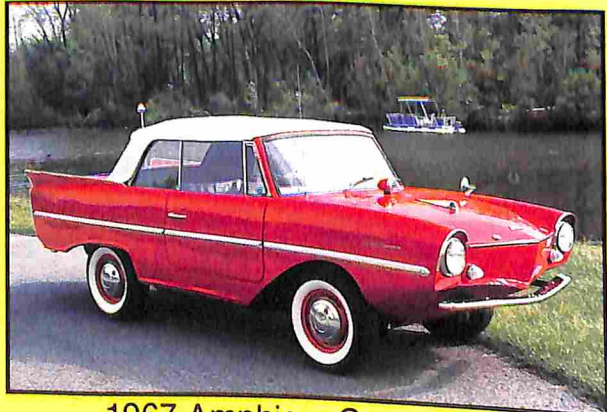
1967 Amphicar Convertible