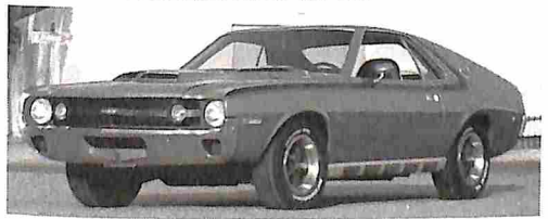
'70 AMC AMX $9,995 ... 84