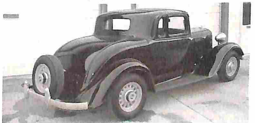
'33 Plymouth coupe $8,900 ... 129