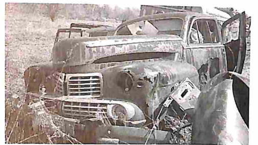
Canadian salvage ... 46