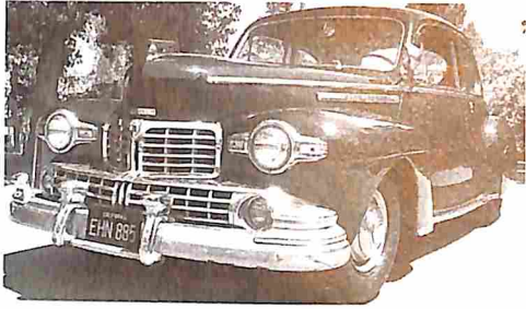
1946 Lincoln ... 60