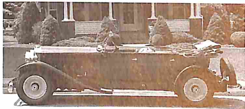
1931 Packard ... 22