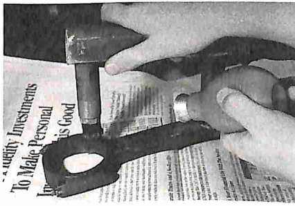
Some resto tips ... 14