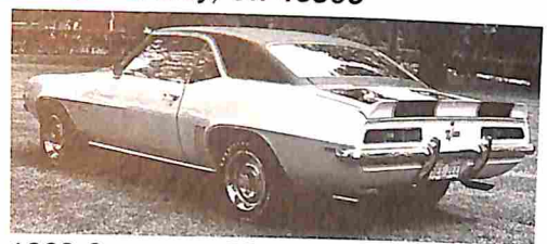
1969 Camaro ... 30