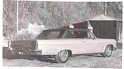
1954 Rambler convertible ... p. 56