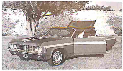
1963 Olds Starfire conv. ... p. 48