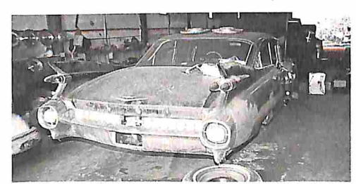
Salvage yard expands ... p. 58